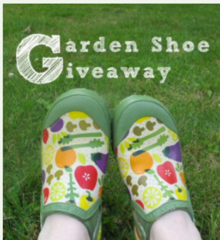
I don't rue the day I received a pair of Bogs' Rue garden shoes. They are fun and practical.

A couple of months ago, I was asked if I would like to review a pair of Bogs' garden shoes. Frankly, I wasn't sure.